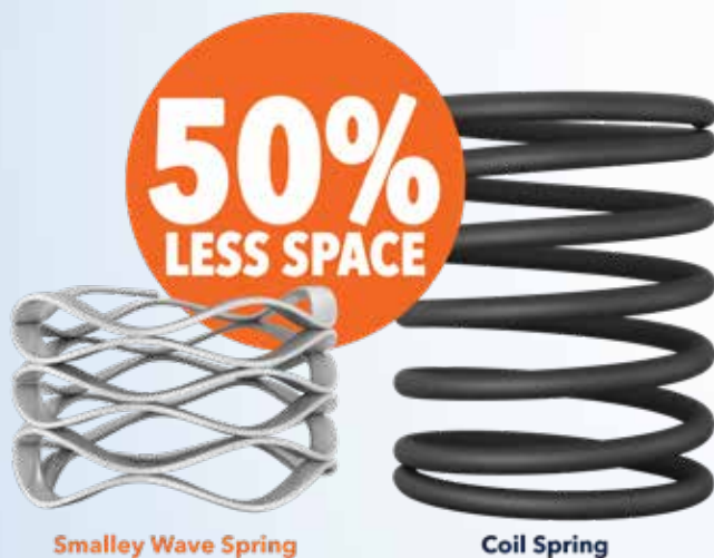
Smalley Wave Spring

QUALITY AND PRECISION OUR SPECIALTY, YOUR ADVANTAGE